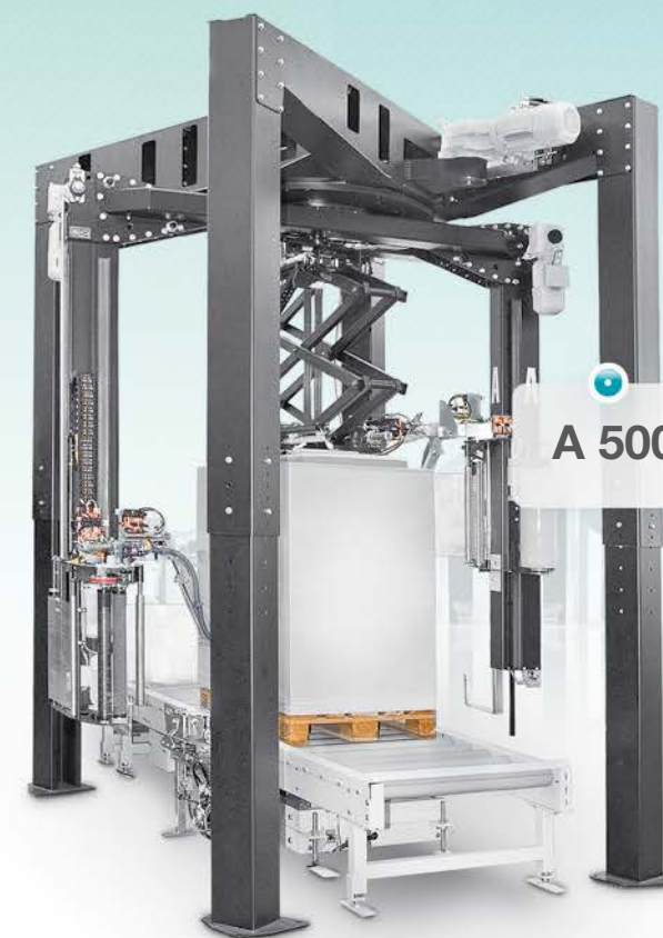
A 5000B II

Waterproof, weatherproof due to an internal cover sheet. Performance: up to 80 pal./hr.